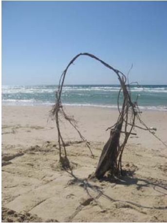
Bridget McCoy's "Archway to the Ocean"

On Friday 21 st August, twelve Year 11 Visual Art students headed down to Burleigh Heads beach to create individual Installation Art pieces for their current unit Form . An Installation art describes an artistic genre of site-specific, three-dimensional works designed to transform the perception of a space. Exterior interventions are often called Land Art, and the students certainly produced some interesting, temporary pieces. We used public transport starting from our very convenient Holland Park West Busway, and then travelled by train and another bus to our destination. The students are to be commended for their wonderful enthusiasm, behaviour and brave 7:40am winter start to the journey!