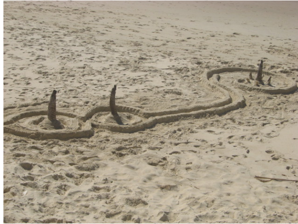
Jason Lamb's work exploring the principle of repetition and the element of shape