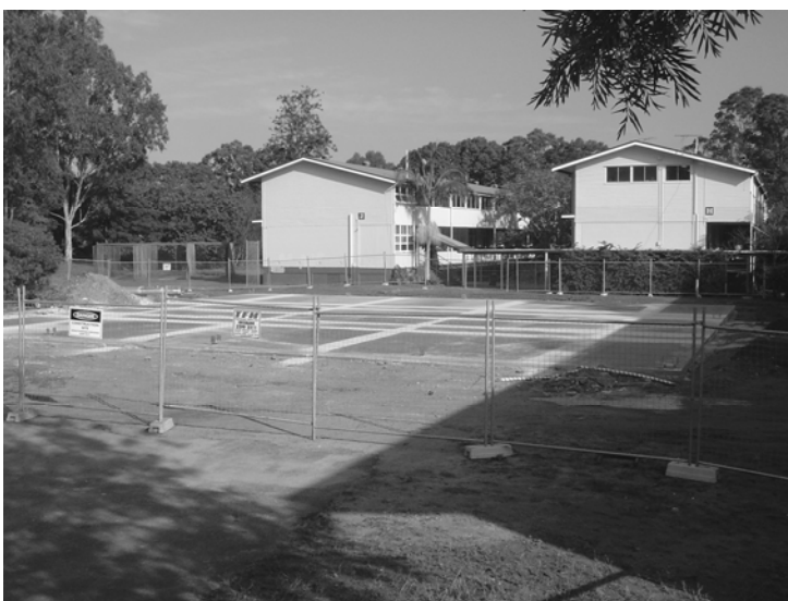
The Sports Shed takes shape

Another piece of excitement around sports day was the commencement of work on our Sports Shed! The protective fencing arrived, the earthworks and site preparation commenced and as I write the concrete is being poured. It's fantastic to see this long awaited project under way.